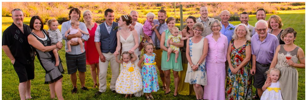
Stewart Family Photo, 2015

Through the Richard John Stewart Family Fund , the Stewart family honors their legacy while also preparing the next generation to carry it forward, making a lasting impact on the Central Okanagan community .